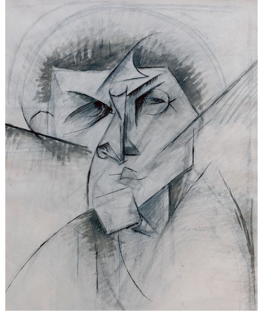
Above Umberto Boccioni (1912) Study for Empty and Full Abstracts of a Head Left Digital rendering (contour) of Empty and Full Abstracts of a Head. Matt Smith and Anders Rådén

Boccioni's best-known work Unique Forms of Continuity in Space , a bronze sculpture of an expressive fluid figure in arrested movement, is featured on the back of the Italian 20c coin. But it was preceded by three works in plaster that reveal its evolution. Now digital renderings of these three lost sculptures, a copy of Unique Forms , and a drawing Empty and Full Abstracts of a Head are featured in an exhibition at the Estorick Collection in London. The show also features maquettes, made by Rådén and Smith using their understanding of Boccioni's work to understand and compensate for the parts of the sculptures not visible in the old photographs.